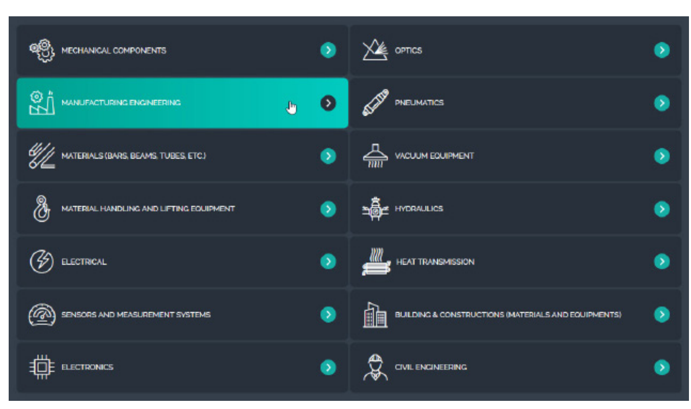
Traceparts content options

The full integration of the HOOPS Communicator took only two months, and the Spatial Technical Account Managers worked alongside TraceParts' developers to provide proactive support along the way.